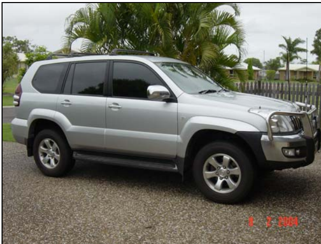
2003 Toyota Landcruiser Prado

This bulletin highlights the introduction of plastic clutch pedals to Australian vehicles.